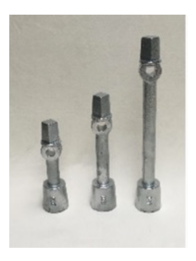
FIGURE 1 DAEMCO VALVE EXTENSION SPINDLES

Each spindle extension is fitted with a M10 Grade 316 stainless steel grub screw to allow for retention to the spindle cap.