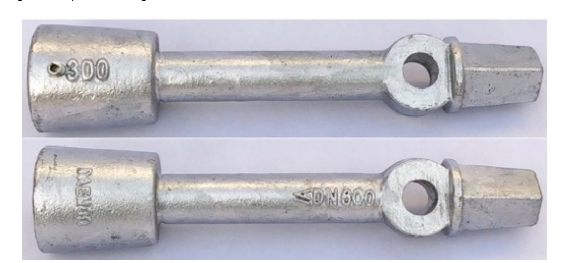
FIGURE 2 PRODUCT MARKING